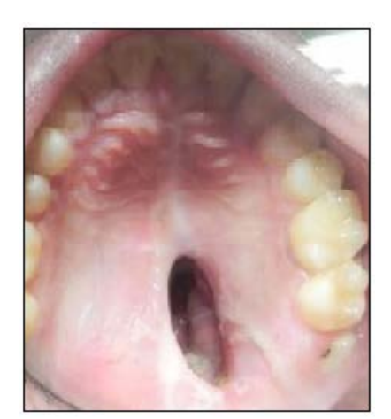
Figure 3: Persistent palatal fistula

Furthermore, ophthalmoplegia, jaw malocclusion and trismus were not detected in our study, though they are known to occur following this procedure.